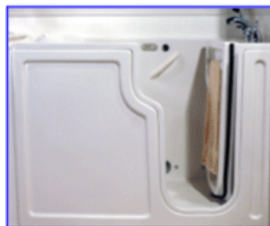
RIGHT Mounted Door

Live Operators are available to assist you 24 hours a day, 7 days a week