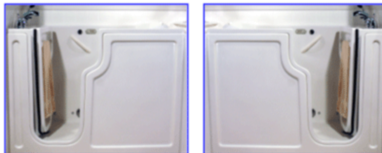
LEFT Mounted Door