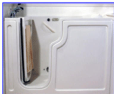
LEFT Mounted Door